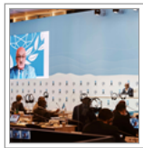
Russia accuses Western powers of compromising