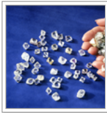
Controversy continues surrounding Russian diamond sanctions