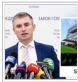
SRK removed from Ukraine’s list of Russian war sponsors