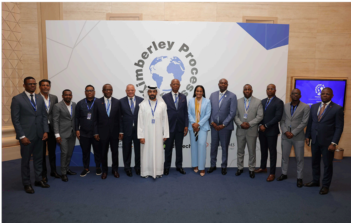
The Kimberley Process is facing demands for more action in response to global conflicts and the impact of war on the diamond industry.