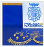
Priest arrested for theft of $100 million gold jewellery