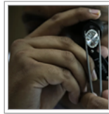
Greenwashing: Lab-created diamond claims questioned