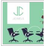
JC Jewels: Diamond dealer ousted from own company