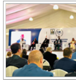
Conflict diamonds: Chaos at Kimberley Process meeting