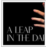
A leap in the dark: Where will the diamond industry be