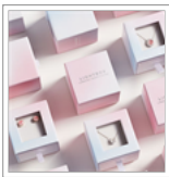
De Beers no longer producing lab-created diamonds for