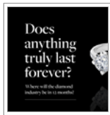
Does anything truly last forever?