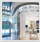
Diamond producer reaffirms focus on Chinese market