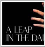
A leap in the dark: Where will the diamond industry be