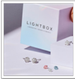
Lightbox confirms changes to controversial pricing