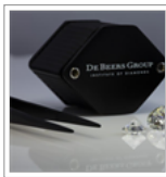
De Beers publishes latest sales results, rejects third takeover