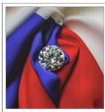
Diamond industry leader calls for changes to Russian