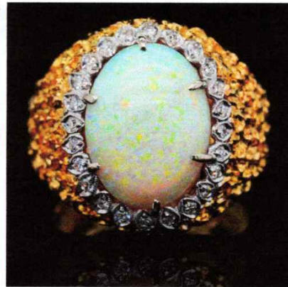
A 14-carat gold and diamond ring featuring an opal centrestone.