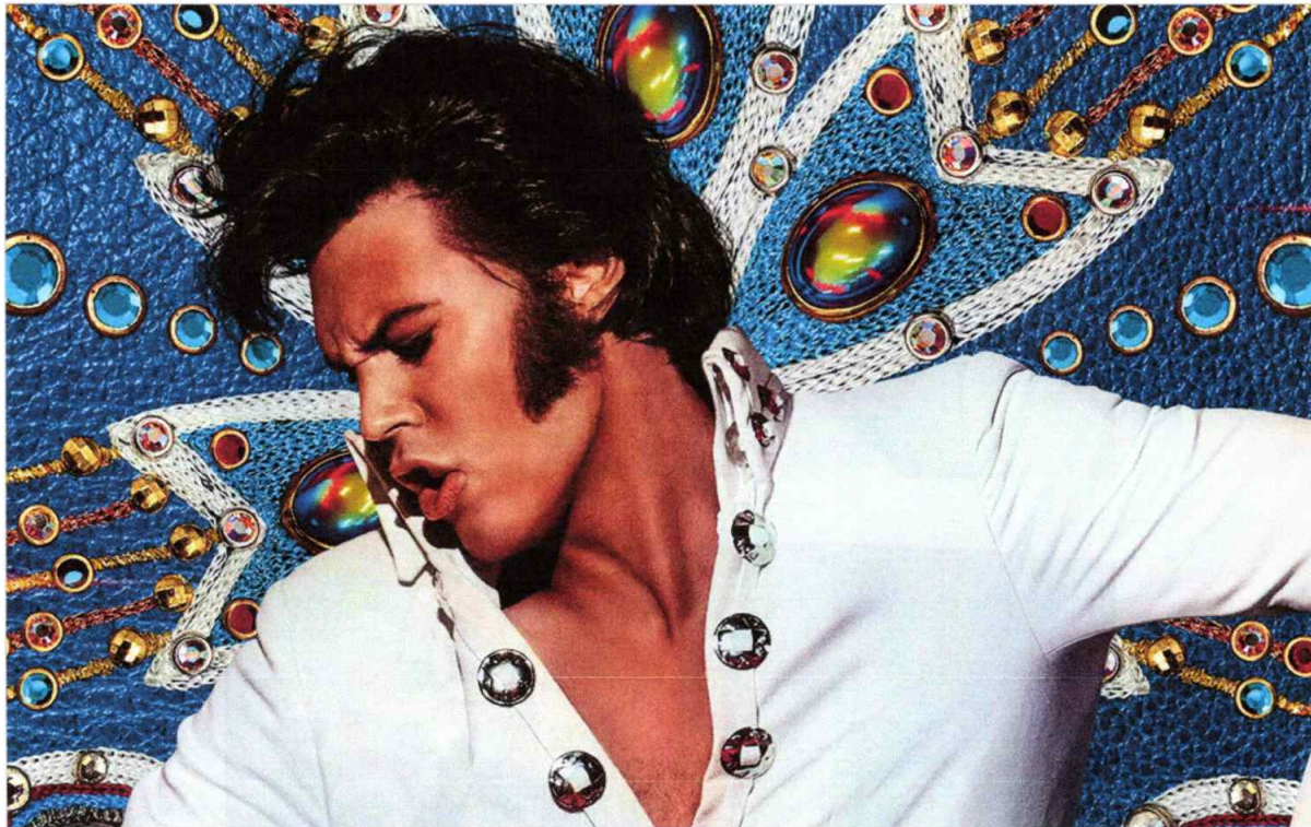
A unique diamond and gold ring owned by rock and roll icon Elvis Presley failed to find a buyer at a recent auction in the US.