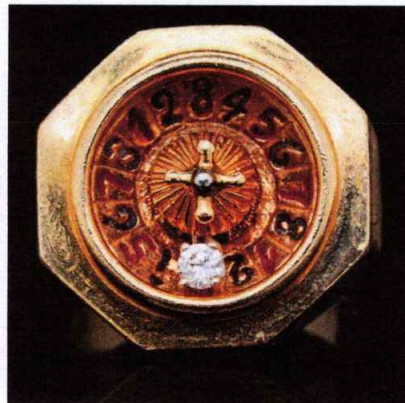
Elvis Presley's gold and diamond roulette ring.