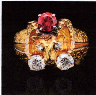
The 14-carat gold and diamond ram's head ring.