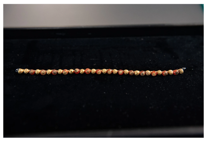
The museum has pledged to return the necklace, which was believed to have been stolen in 1976.