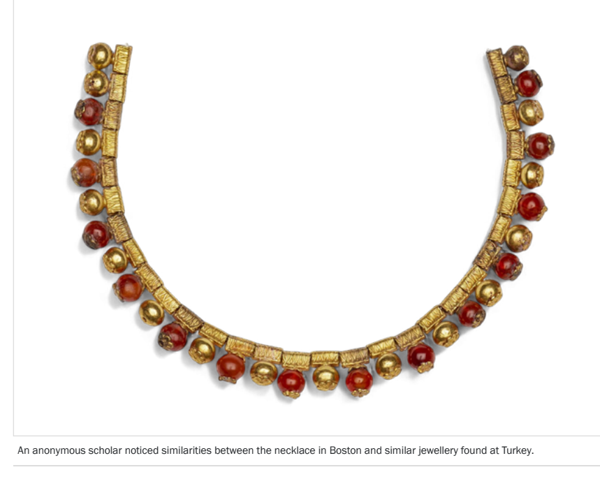
An anonymous scholar noticed similarities between the necklace in Boston and similar jewellery found at Turkey.