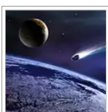
Ancient Egyptian jewellery out of this