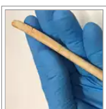
Bone revealed as Australia's oldest