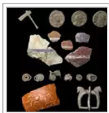
Ancient Roman jewellery unearthed in England