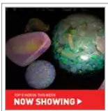
Now Showing: Can you grow an opal?; top 10 most impressive diamonds