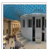
British Museum's reputation challenged