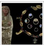
History in the making: Australia to showcase Ancient Egyptian jewellery