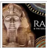
Legendary jewellery of the Pharaohs arrives in Australia