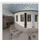
Jewellery and gemstones stolen