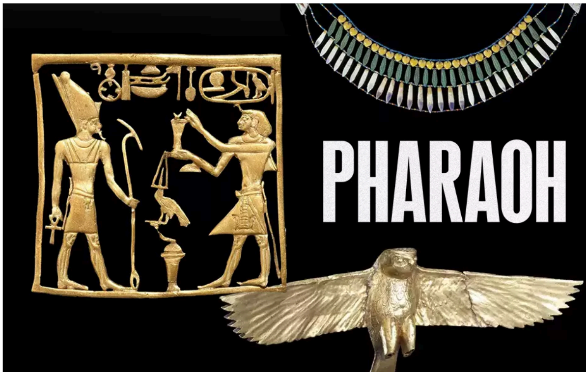
As the National Gallery of Victoria's 'Pharaoh' exhibition comes to a close, the showcasing of ancient Egyptian jewellery has proven particularly popular among visitors.