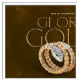
Year of the dragon: Glory of gold