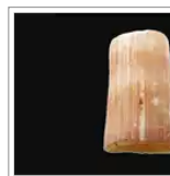
Coloured jewellery bead discovered; 23,000 years old