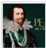
Pearls are a man's best friend