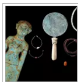
Blast from the past: 4,000-year-old jewellery unearthed