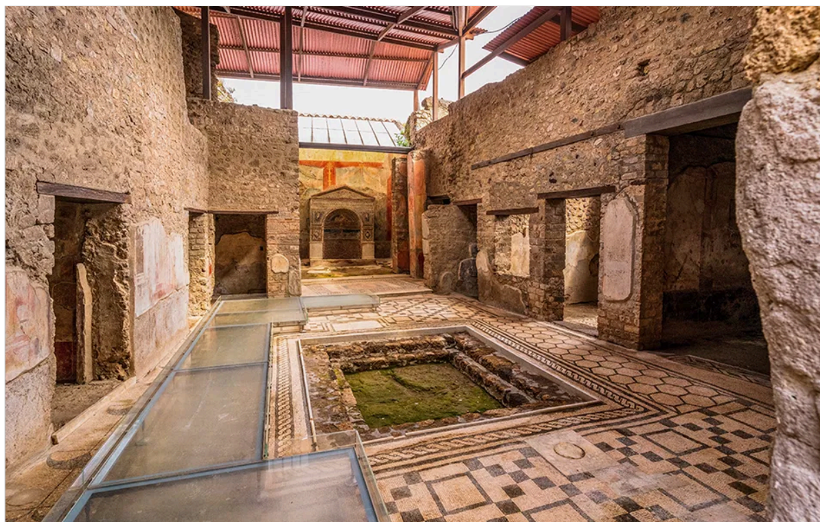
A large private luxury bathhouse has been discovered in Italy more than 2,000 years after it was concealed by a volcanic eruption.