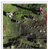
Viking Jewellery paints a vivid image of historic society